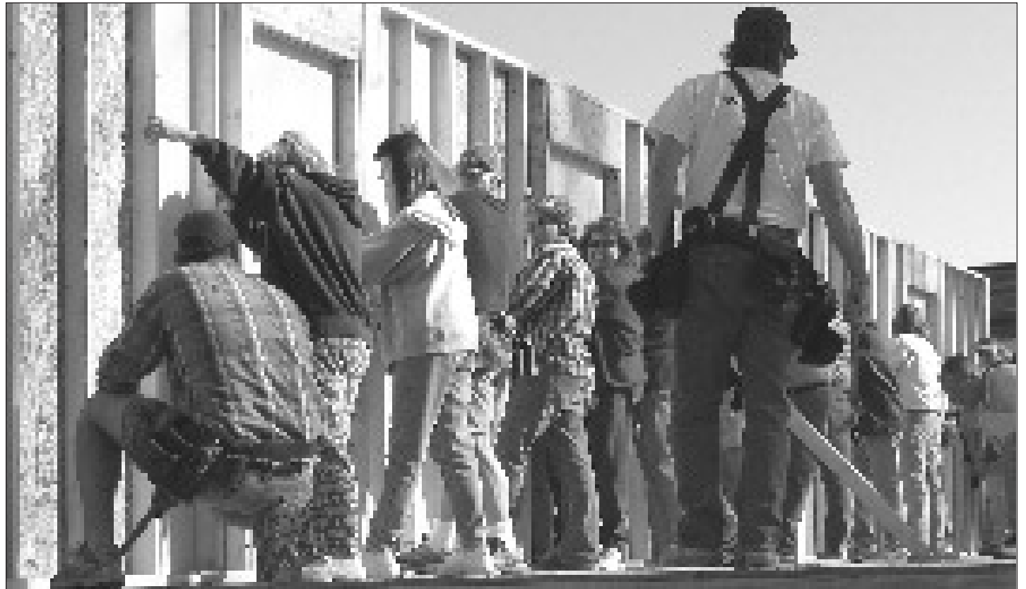
Habitat for Humanity volunteers work on a project that will give a Monroe County family a new home.

Volunteers are needed to help construct homes Wednesdays, Thursdays, and Saturdays throughout the summer and fall. To work on site, volunteers must be 16 years of age. No long-term commitment or building skills required; just come out for a day and learn! Contact Sean at 331-4069 or volunteerhabitat@bloomington.in.us for more information.