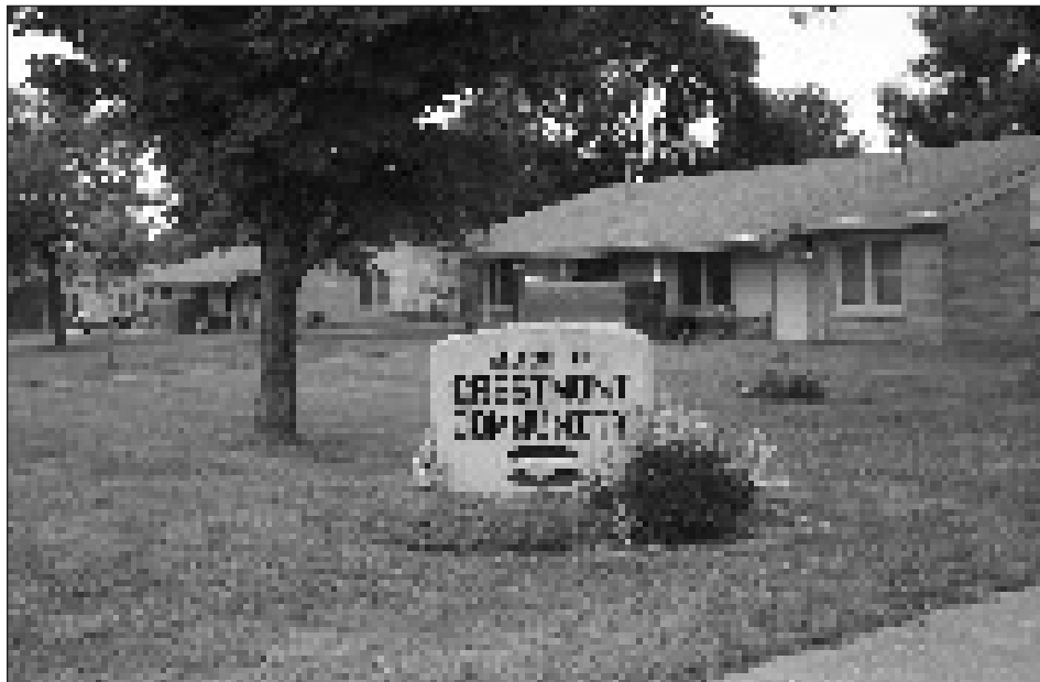
Crestmont Community is one of the housing services offered by the BHA.