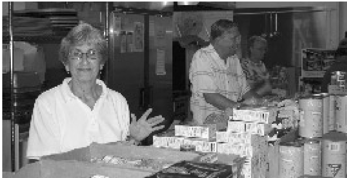
FUMC volunteers offer time to help those less fortunate than them.

When the Shalom Center was organized several years later, they decided to serve