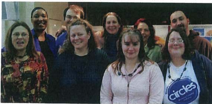
Monroe County Circles Initiative Graduation Class 2008

The Monroe County Circles™ Initiative is a high-impact, community-owned strategy to build intentional friendships across race and class lines and aid vulnerable families in achieving self-sufficiency. Low-income participants attend a 15-week training, "Getting Ahead in a Just Getting by World," designed to increase their educational, financial, social and spiritual resources. Those who successfully complete the training are offered the option of participating in the Circles™ Initiative, which matches each participant, called a "Circle Leader," with trained "Circle Allies" who offer continued support. Weekly meetings help grow community, identify and address barriers to self-sufficiency and give back by offering information to the community about poverty in Monroe County.