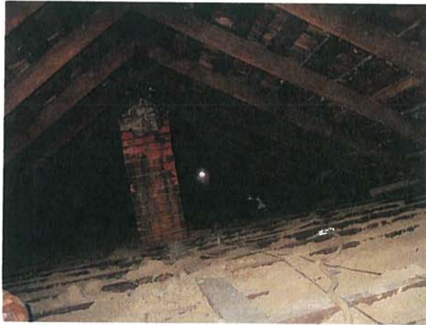
Insulating an Attic in a client's home

SCCAP Weatherization Energy Auditors are highly trained and are certified through INCAA and BPI as Building Analysts and Heating Technicians. Our contractors are also trained through INCAA and are certified BPI Building Technicians.