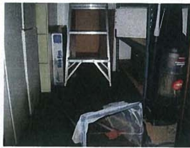
Morgan County Office Flood Damage, June 2008