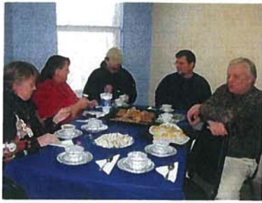
Staff Tea Party 2008